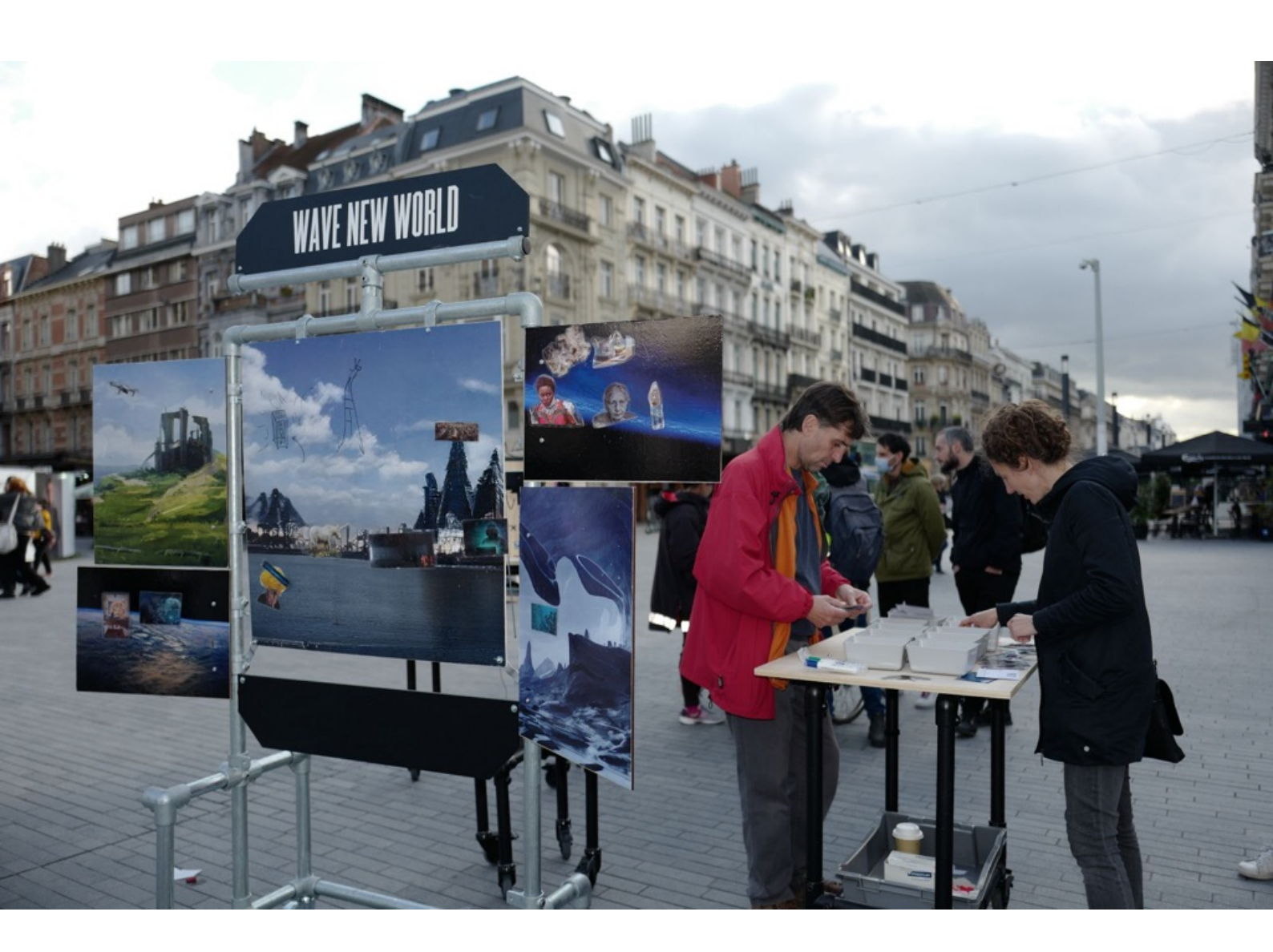
Fig 4. Wave New World/Le Meilleur des Ondes: a set of speculative mobile devices that invited passers-by to express their fears or aspirations regarding the deployment of 5G in Brussels. This intervention took place in collaboration with various associations and movements concerned by these questions and wanting to open up the debate to as many people as possible