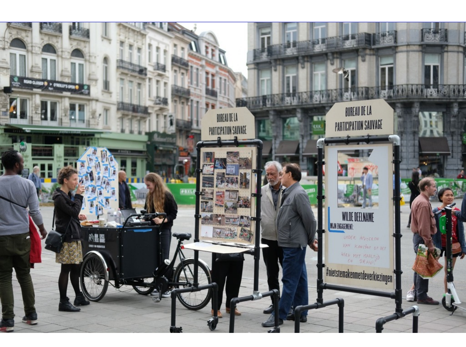
Fig 1. The «wild participation office»: a set of mobile devices, combining seriousness and humour, placed on Place de la Bourse during the 2019 elections. These «investigation and participation» devices invited passers-by to give an account of their daily commitments, as well as what, for them, was «political».