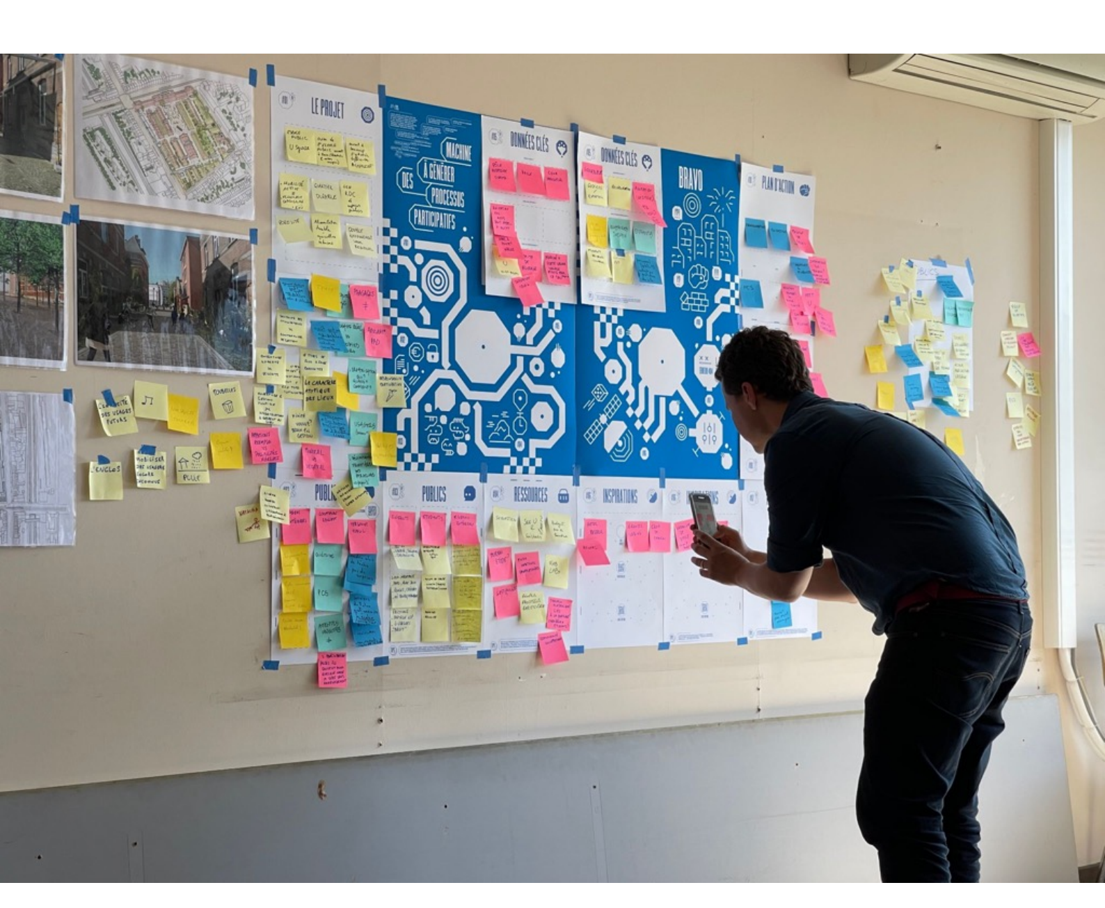
Fig 3. MA/PA: a committed and reflexive brainstorming tool for any person or group wanting to set up participatory processes in the framework of urban projects. MA/PA was developed with perspective.brussels and underwent user tests and critical feedback from various Brussels stakeholders.